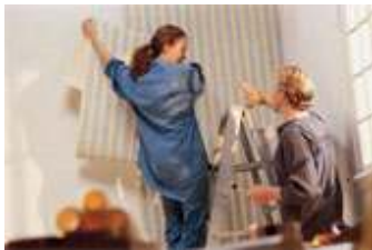
Figure 4: www.homeservicesengine.com